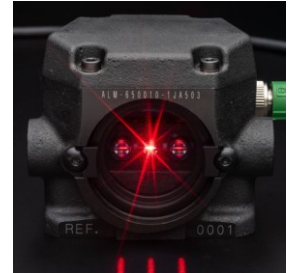
Front view of parallel type housing