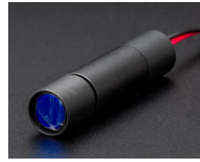
φ8mm standard housing

LINEMAN is a product that can generate line beams with ideal uniformity using an aspherical lens.