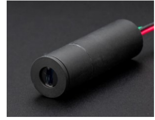
φ10mm high heat dissipation housing (for high power output)