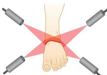
Human 3D measurement